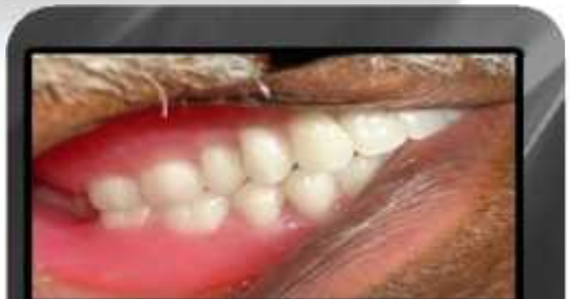
Post op left &