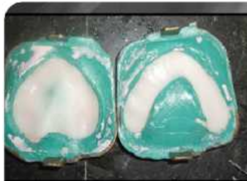
Packing clear acrylic resin