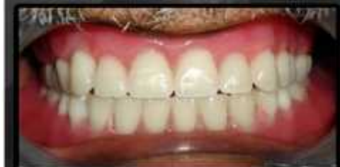
Centric occlusion Frontal