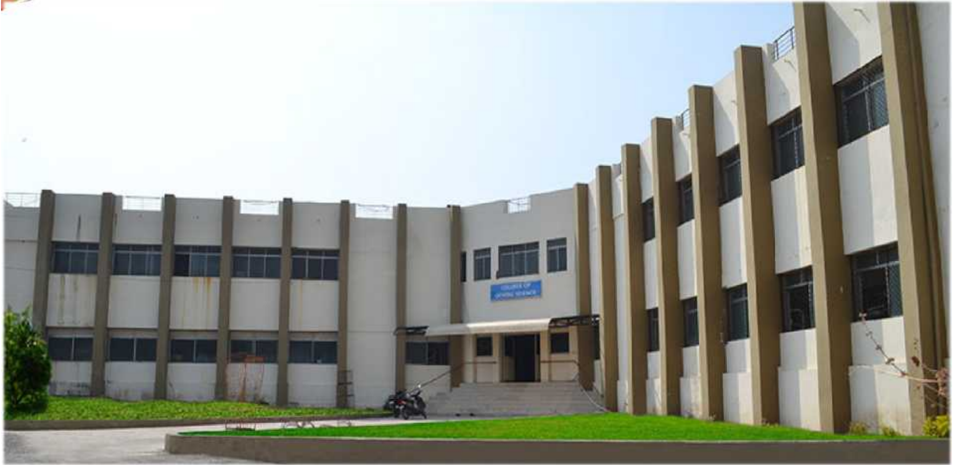
COLLEGE OF DENTAL SCIENCE & HOSPITAL, K.J.MEHTA T.B. HOSPITAL TRUST, AMARGADH, BHAVNAGAR, GUJARAT STATE, INDIA. Affiliated to M.K. BHAVNAGAR UNIVERSITY